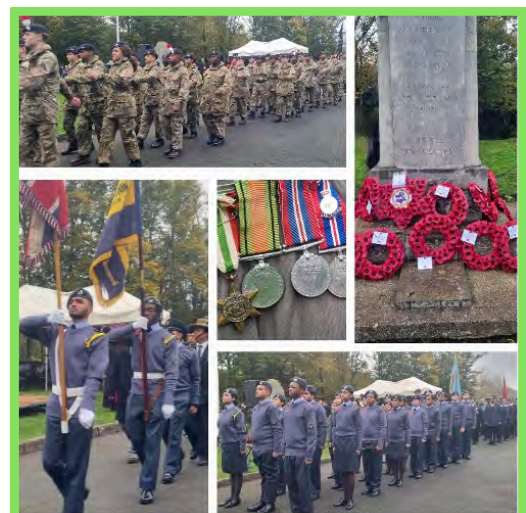
7th Wembley taking part in the Remembrance Parade in Barham Park