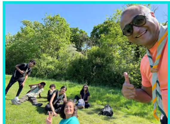
Explorer Section taking a break in Fryent Countryside Park during the Hike across Brent