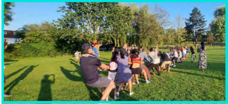
The clear blue skies of last year sports day in Preston Park

Hello and welcome to our third Annual General Meeting Report of the 7 th Wembley Scout Group.