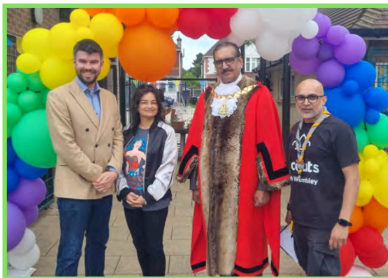
Local Preston Councillor and Brent Mayor (for 2024) supporting the summer fair

I have enjoyed getting to know the children and young people in our group, their parents, and the Leaders. We have created a lovely community at 7th Wembley.